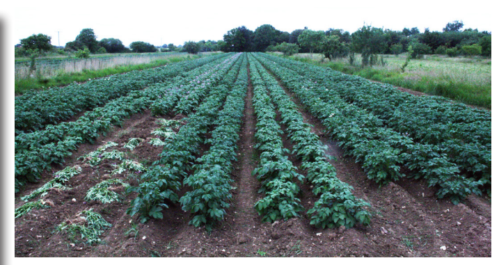
Potatoes at Wakelyns - June 2014